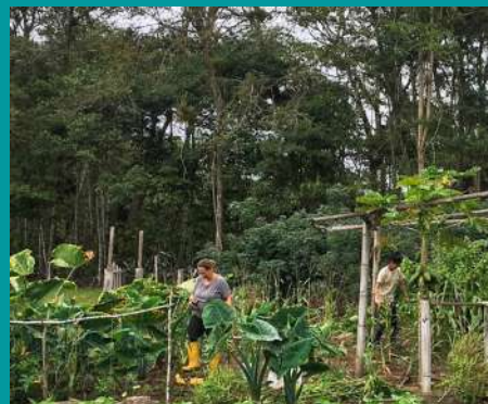
Responsible Consumption & Production