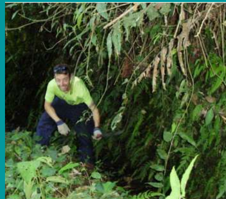
Climate Action & Conservation